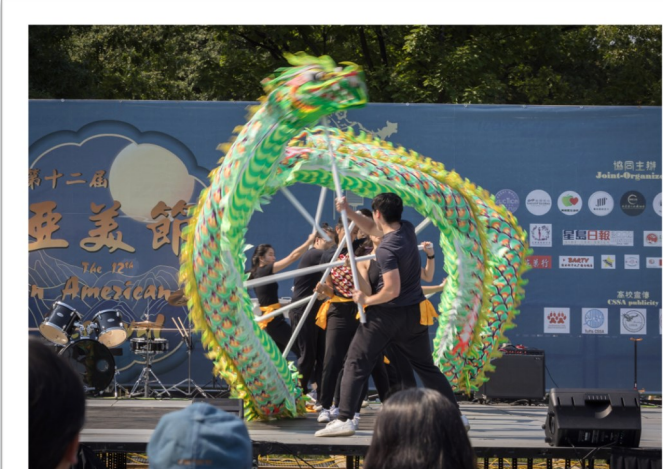
中國傳統舞龍節目亮相亞美節。The traditional Chinese dragon dance show appeared at the Asian American Festival. →

2022年9月10日，由波士頓地產網冠名贊助的第十二屆亞美節在波士頓市中心 Boston Common 正式拉开帷幕。開幕式現場，來自波士頓及麻州各界的數十個藝術、文化團體，在波士頓亞美聯誼會的号召下，开展了声势浩大的庆祝游行。每个团体高举着属于自己的旗帜和横幅，由中国传统的舞狮队带领，在 Boston Common 内主要路段上绕场一周，吸引了无数游客的注意。