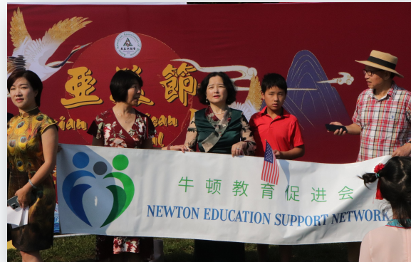
← 參與亞美節的團體在特色文化背景板前合影。留念 The groups members who joined in the AADay Festival took a group photo in front of the Chinese style cultural background board.