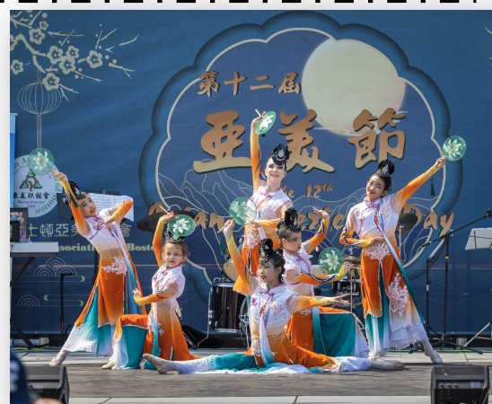
中國傳統舞蹈亮相亞美節現場表演。→ Chinese traditional dance on AADay Festival live show.

On September 10, 2022, the 12th Asian American Day Festival sponsored by Blue Ocean Realty, was conducted at Boston Common in downtown Boston. At the opening ceremony, more than 20 of art and cultural groups from all ethnicities in Boston and Massachusetts, under the call of the Asian American Association of Boston, launched a massive celebration parade. Each group held its own flags and banners high, led by a traditional Chinese lion dance team, and circled the main road in Boston Common for a week, attracting the attention of countless tourists.